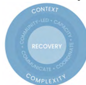
Diagram 2. The national principles for disaster recovery

By designing and delivering activities and services that apply these principles sustainability and resilience can be built, and government and funded services can withdraw from the recovery process and allow the community to manage its own recovery.